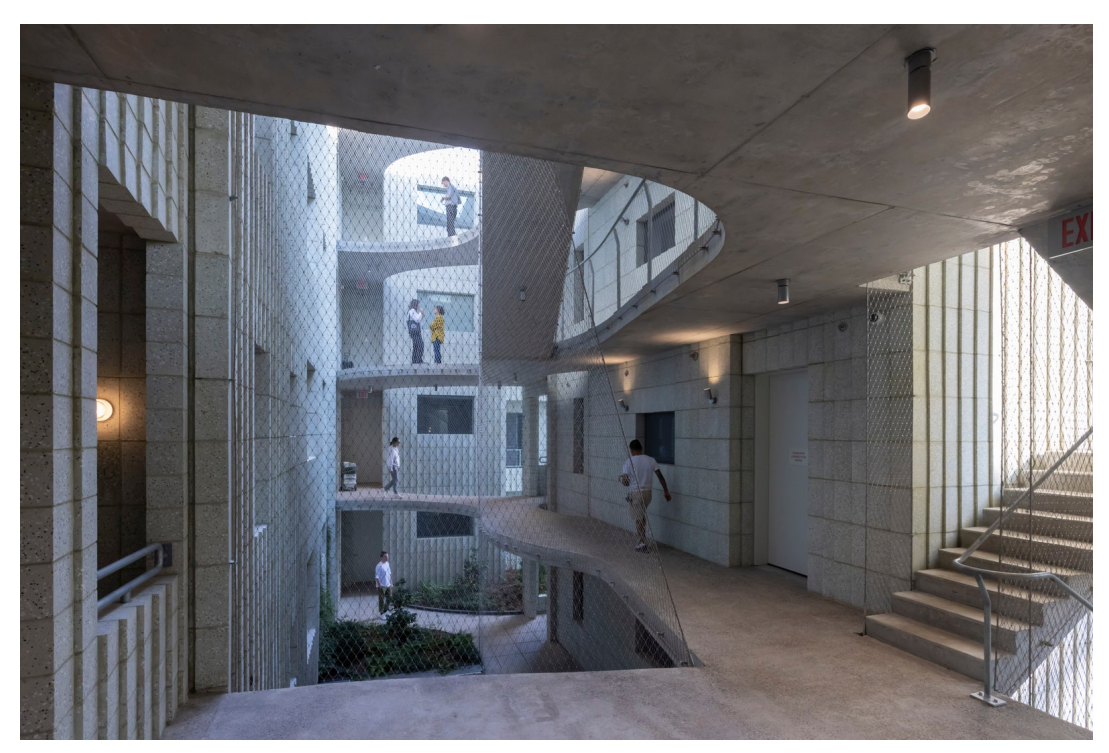
Life in action on the project's network of skywalks.