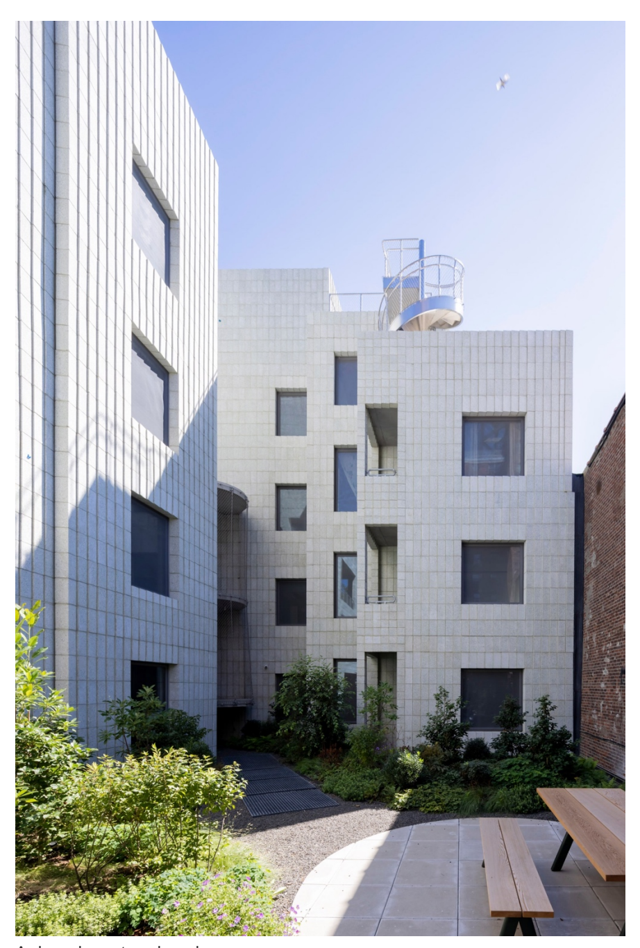
A shared courtyard garden.