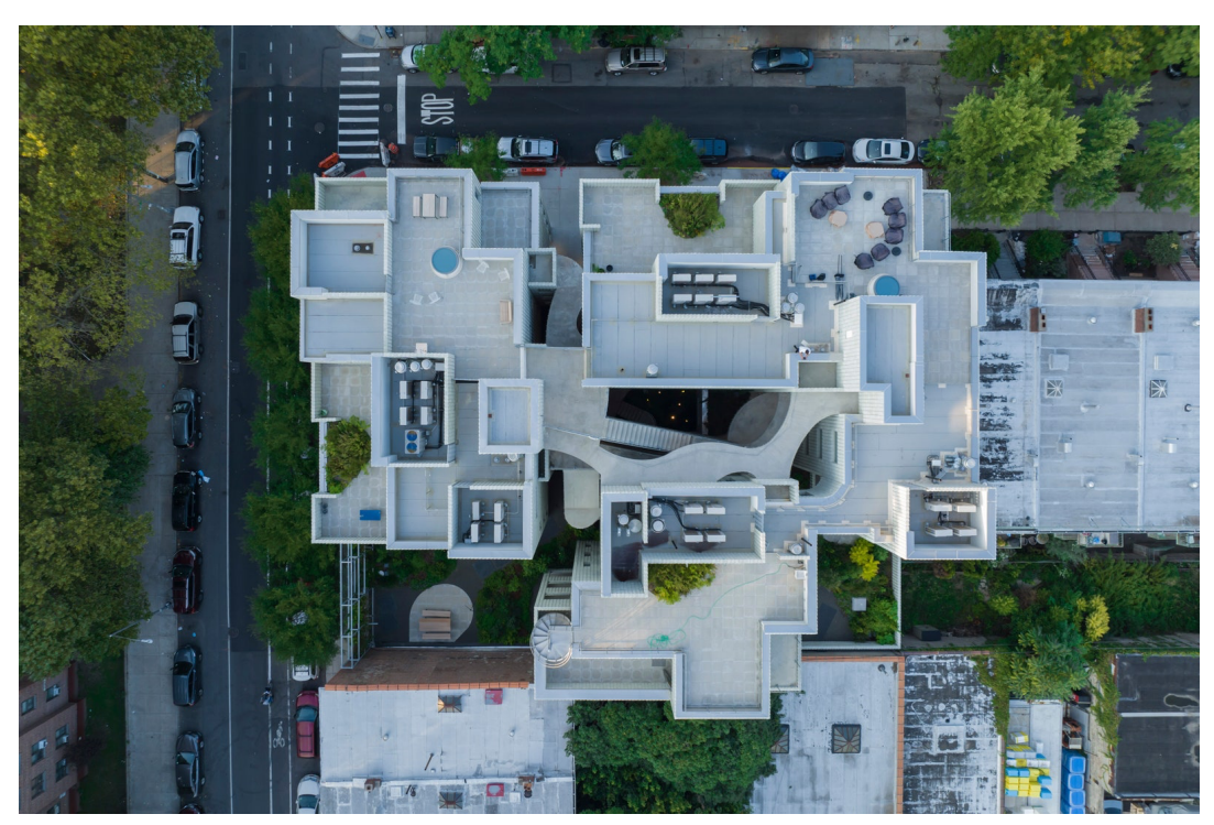
An aerial view of the complex.